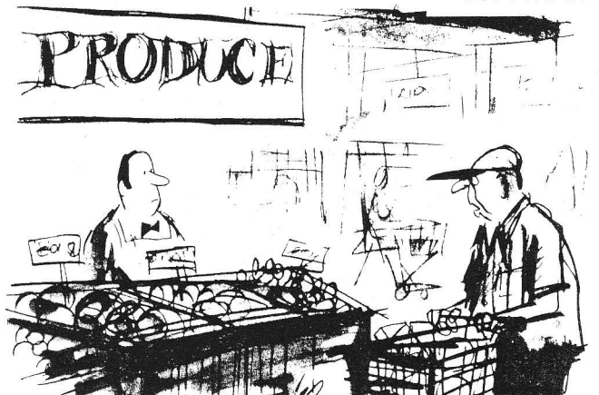
"Give me some of whatever the bleeding hearts are boycotting."