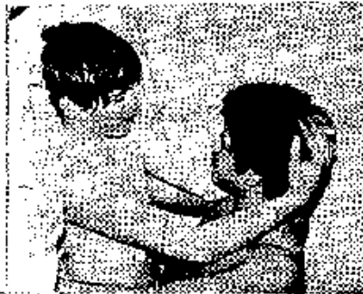
* Good faculty student relations