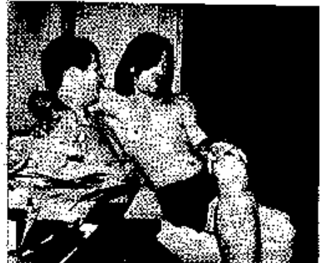
Our own spacious student lounge offers opportunities to brush up on basic skills.