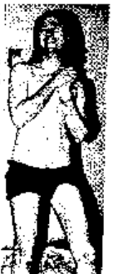
Our first Graduate

G.E. 906, Advanced Transcendental Orgasticism : A post-graduate practicum in the mystical ecstasy of orgasmic practice. Only given that term when all the planets are in conjunction.