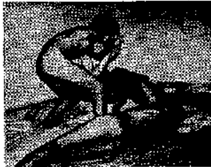
* Try a few opening exercises

A seminar workshop in creative experimental erotics. The class pairs off and explores on of each others bodies begins. Starting with the urinary erotic zones, oral, anal and genital the entire body is systematically stimulated in different ways to determine the erotic effect. Varieties of stimuli are investigated such as light and heavy caressing and stroking, different kinds of kissing, types of orgasm and personality and the responses of each. The positions of intercourse are thoroughly explored and the unique needs, capacities and responses of each person are discovered. This yields all of participants an individual erotic profile or inventory of the present state of erotic sensitivity and awareness of each. This erotic inventory is very useful in getting maximum enjoyment from your erotic experiences. Required of all students in all programs. No pre-requisites.